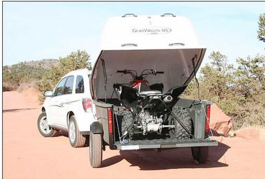
Let's Go Aero

The GearWagon 125 retails for $1,795 without the top or $2,995 with the lid. A sleeping platform that holds two people is also available.