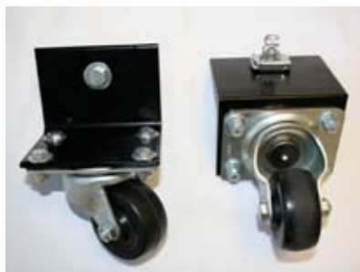
Mount to C Channel Track