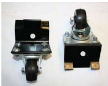
Mount to Frame Tubes